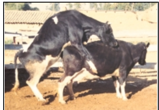
Figure 1: A cow is in heat when she stands immobile when mounted by another cow or bull. A cow that mounts another cow may or may not be in heat.

Detection of heat calls for acute observation. Most cows have a pattern of behavior that changes gradually from the beginning to the end of a heat. The best indicator that a cow is in heat is when she stands and allows herself to be mounted by herdmates or a bull (Figure 1). A series of signs that may help to identify cows that need to be observed closely are summarized in Table 1.