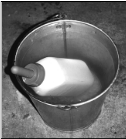
Figure 3: Measuring the amount of milk, feeding with a nipple bottle or bucket and adjusting the milk temperature are important aspects of feeding a calf well.